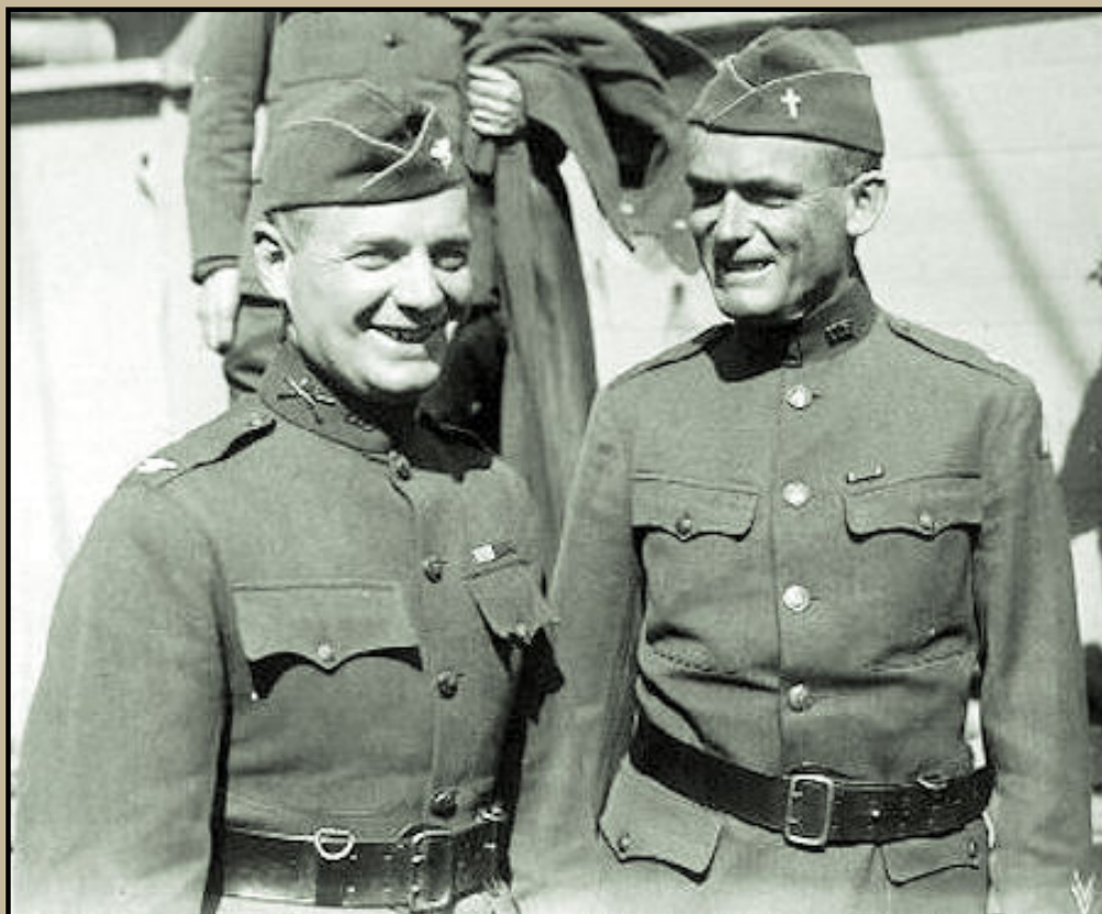
The Best-Known Veterans of the Regiment Colonel William Donovan and Father Francis Duffy