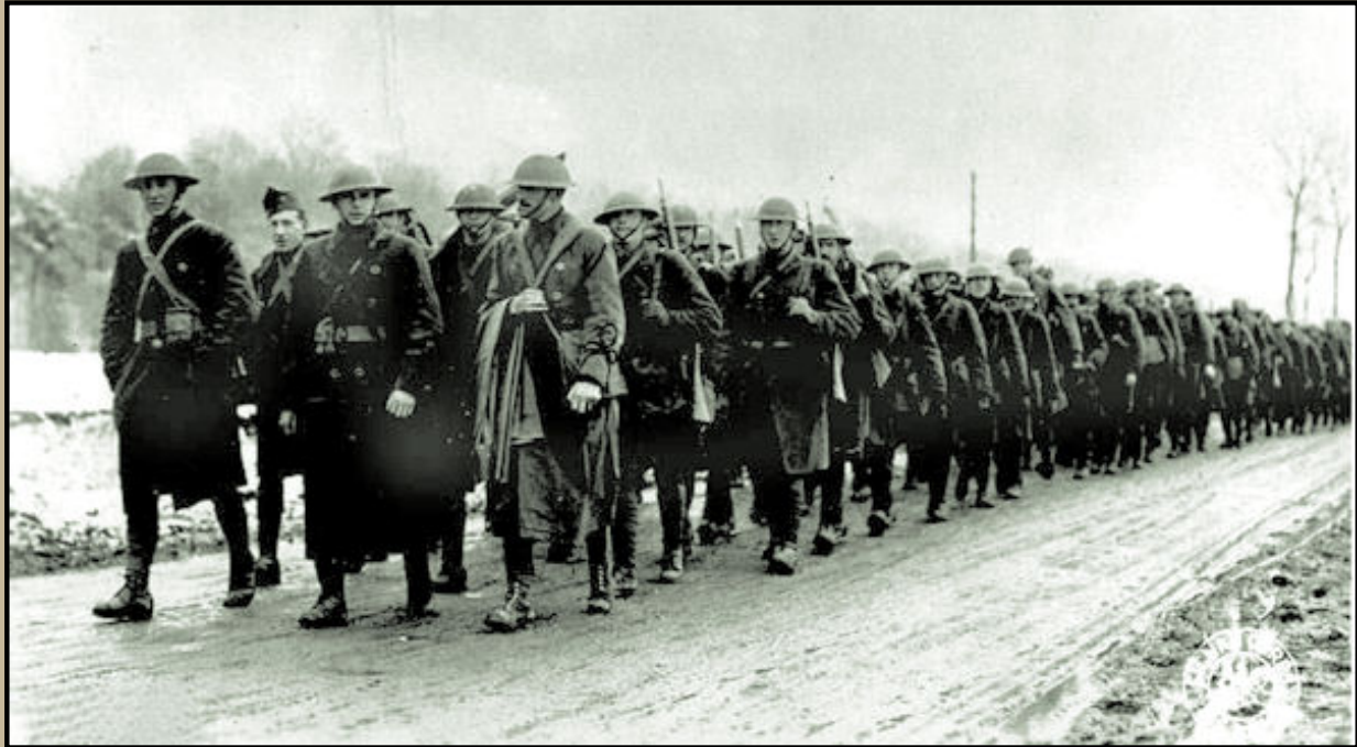
Company K, 165 th Infantry on the March They Would Be in the Heart of the Coming Action