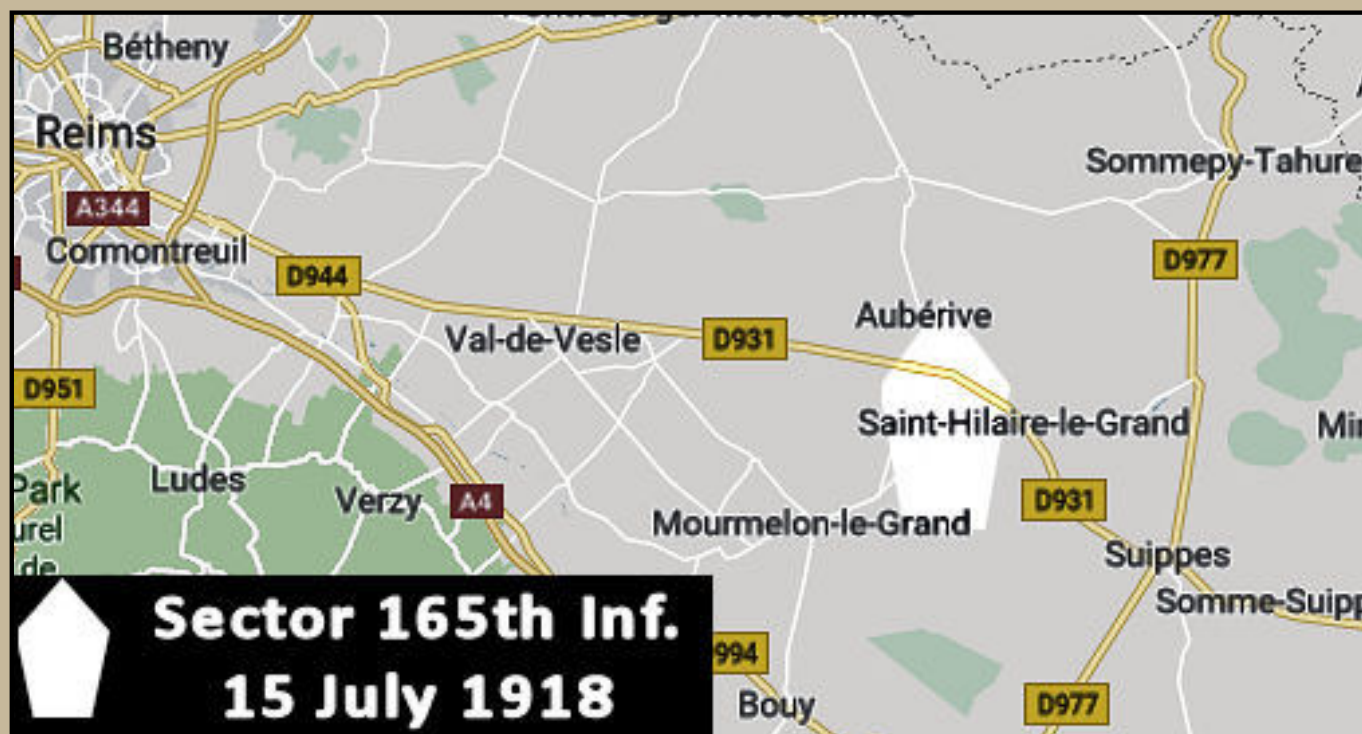
Location of the Regiment's Deployment