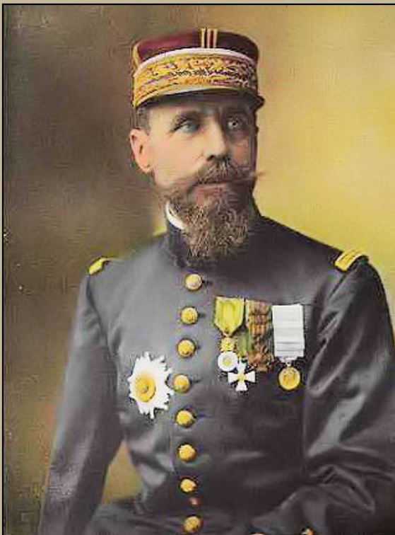
General Henri Gouraud, Commander Fourth Army

At 51, Henri Gouraud had seen enough bloodshed to last a hundred lifetimes, much of it his own. For most of his military career, he had served in the French Colonial Army. His exploits in the jungles and deserts had become legendary and had earned him the title "Lion of Africa." At the start of the Great War he had commanded the Tenth Infantry Division and taken a bullet in the shoulder in the Argonne Forest. In another battle he was struck by a shell that ripped apart his body: he lost an arm and nearly lost a leg. But those wounds had never slowed him down. In December 1915, he took command of the French Fourth Army.