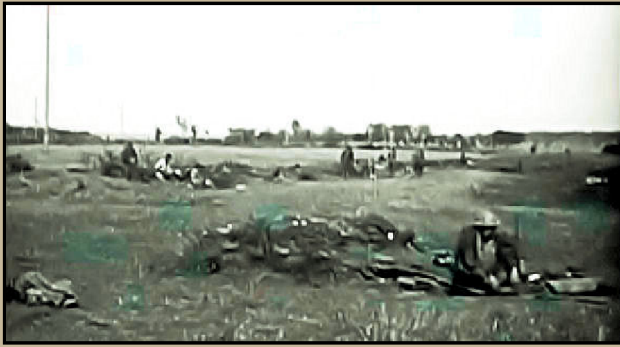
Typical Terrain in the Sector