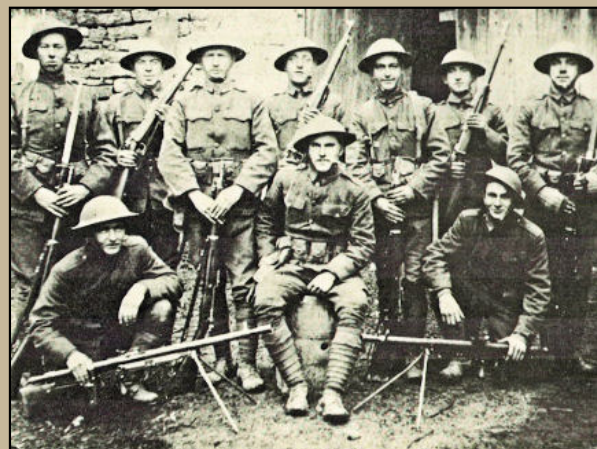
Men of L Company After the Fight